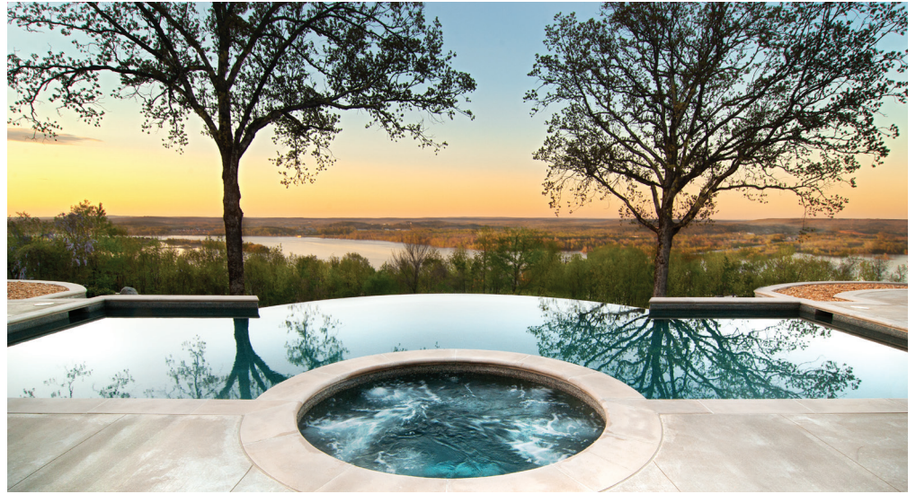
Brooks Infinity Pool and Spa

A third-generation company with over four decades of experience in the pool construction industry, Brooks Pool Company brings an unmatched combination of knowledge, skill and expertise to every project, enabling us to take on projects of any description from breathtaking infinity pools and lavish fountains to tranquil water features. Each project is constructed and finished at our highest standards and comes with a guarantee of quality beyond compare.